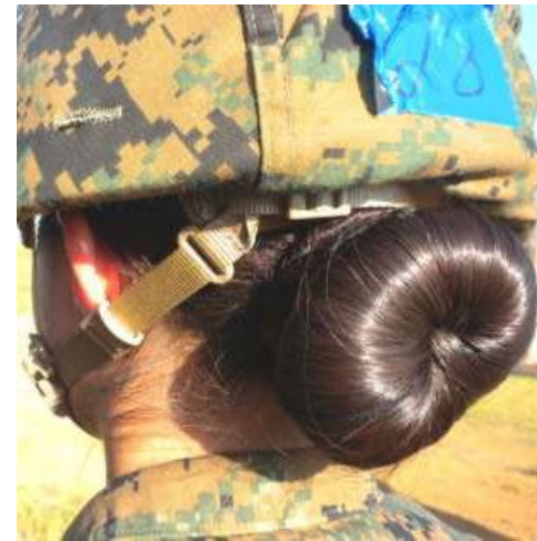
Improved Retention System for helmets