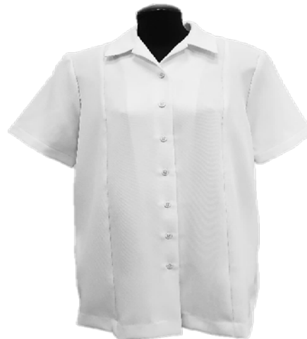
Improved Dress/Summer White Design