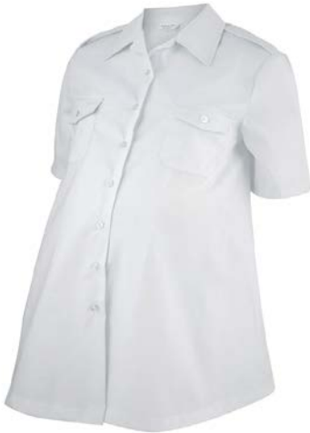
Current Dress/Summer White Design