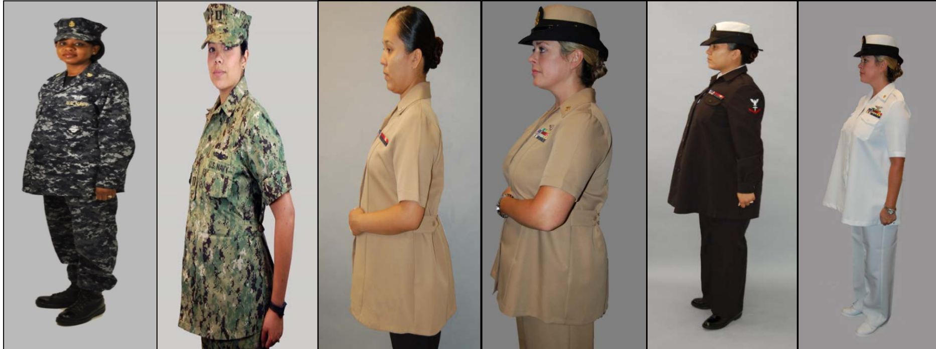
Navy Working Uniform (NWU Type I)