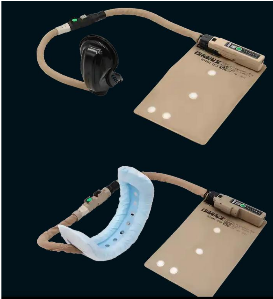
Figure 4: SKYDRATE

A3. The Navy has two systems in development through the Small Business Innovation Research (SBIR) program, Materials and Technologies (MATECH) Aircrew Bladder Relief Device (ABRD) and Triton Systems Superior Portable Urine Relief System (SPURS) that can also be used without unstrapping from the aircrew seat. The purpose of the SBIR efforts are to develop a low cost solution that would improve comfort and performance. The objective cost for consumables in 2019 dollars was $50/flight with a threshold of $100. It is estimated that both of the solutions below will meet the threshold cost target. Both systems in development consist of a disposable HI worn by the aircrew, a pump that is cleaned and reused and a disposable collection bag that stores the urine. The HI is an external product. The government is developing a universal pass thru interface to allow use of new systems with an anti-exposure suit without routing the hose through the relief zipper.