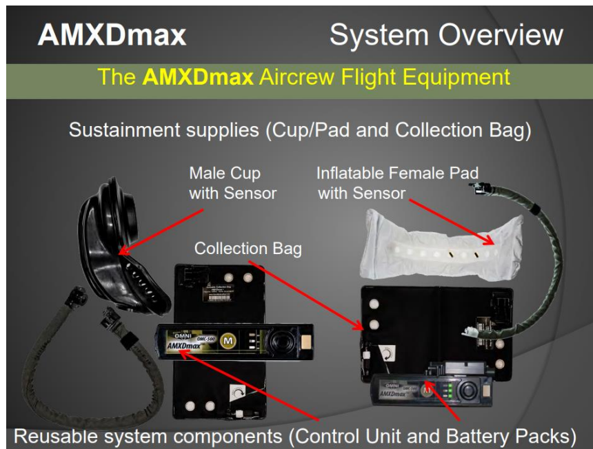
Figure 3: AMXDMax

The Navy is actively testing the next generation AMXDmax system, rebranded as SKYDRATE (Figure 5) for Navy and Marine Corps use. SKYDRATE has an improved pad design, added an in-line power switch and increased the capacity of the pump.