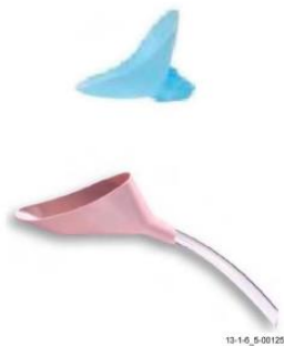
Figure 2. Lady J and Freshette