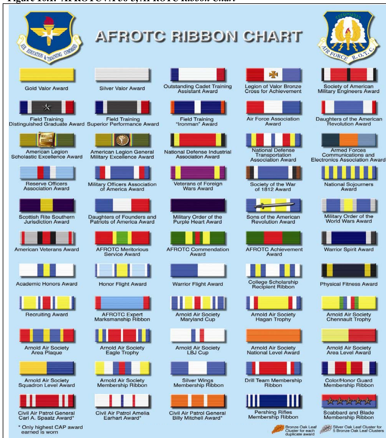
Figure 10.1. AFROTCVA 36-3, AFROTC Ribbon Chart